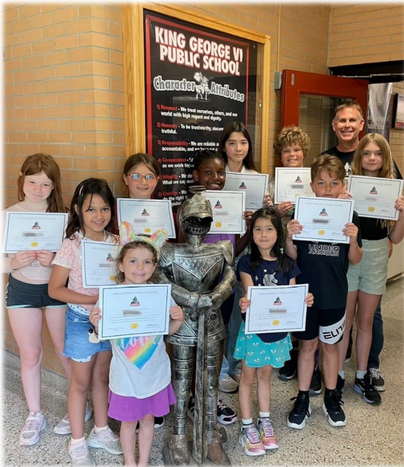
May Character Award recipients, recognized for modelling good citizenship .