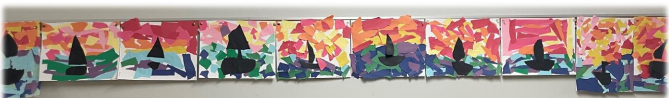
Grade 3 ushered in summer with these beautiful sailboat art masterpieces!